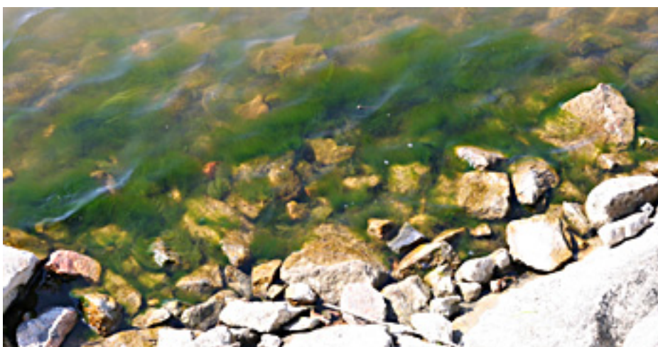
Figure 3. Baltic Sea Eutrophication. (Helsingin yliopisto 2007.)

reduce the amount of substrates. Thirdly, the huge amount of nutrients during the vegetation period gives a boost to opportunistic species with short life cycles and fast development compared to perennial species with lower productivity. That results in a shift in community composition. What is more, the effect of eutrophication can be seen in the fish communities in loss of shelter and turbid water (Helsinki Commission 2009, 113-114.) The figure 3 below illustrates the problem of eutrophication in the Baltic Sea. As can be seen from the picture the alga has gathered as big loads to the coastal areas of the sea. The eutrophication threatens the Baltic Sea diversity.