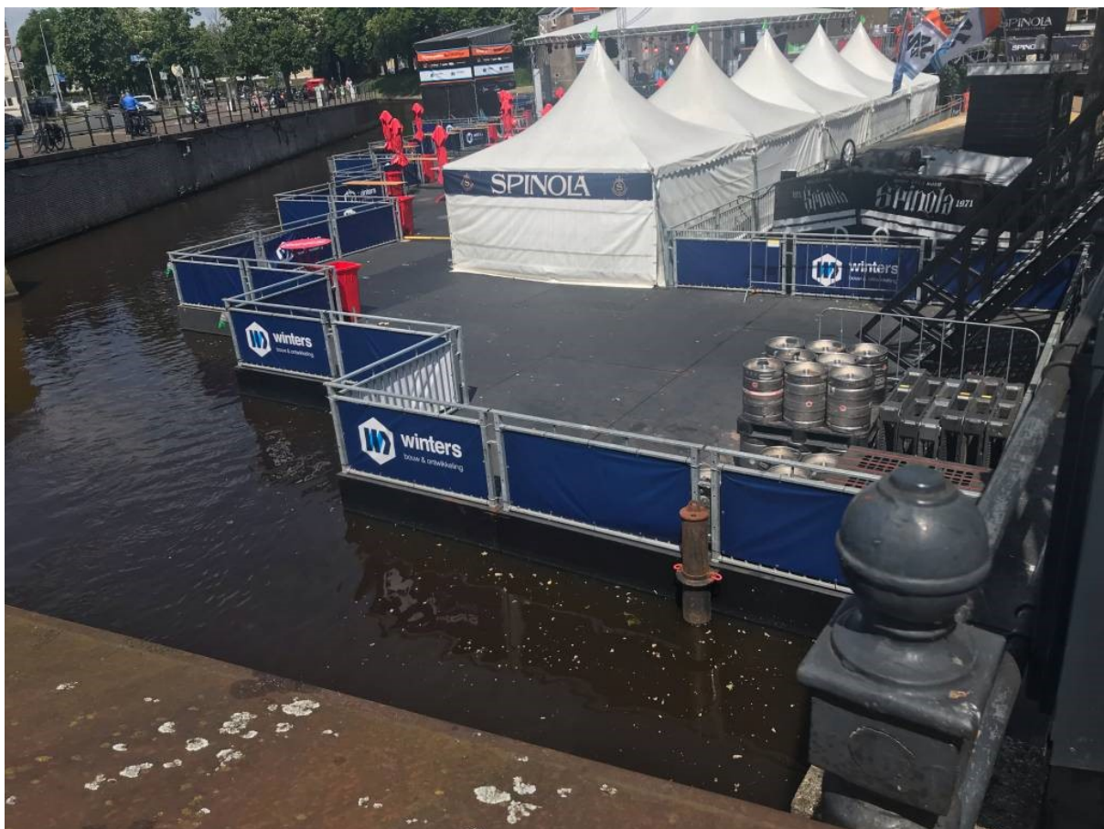
A jazz club built on water in the canal.