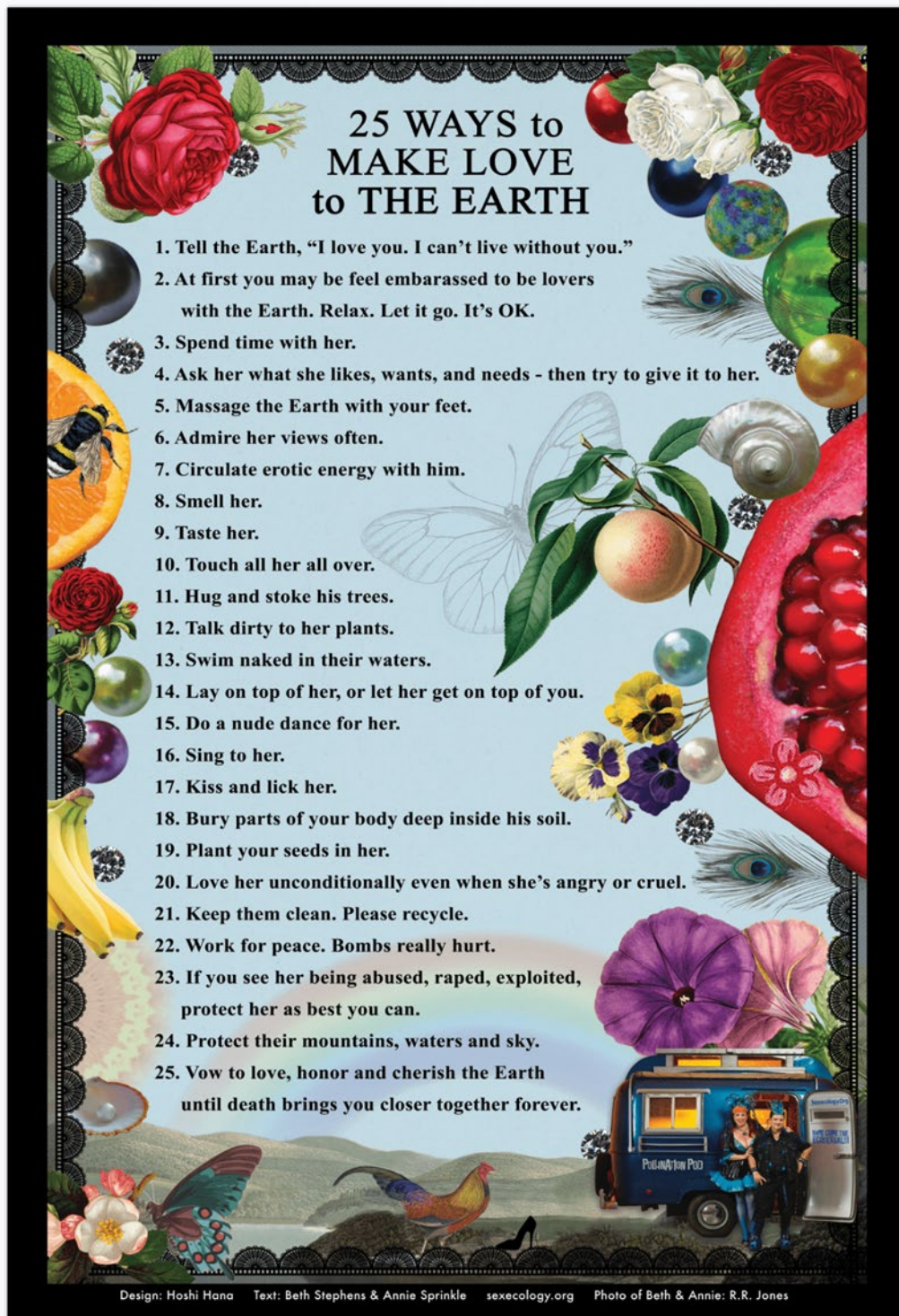
Picture 3. Annie Sprinkle and Beth Stephens, 2019, 25 ways to make love to the earth, digital poster. Design: Hoshi Hana.