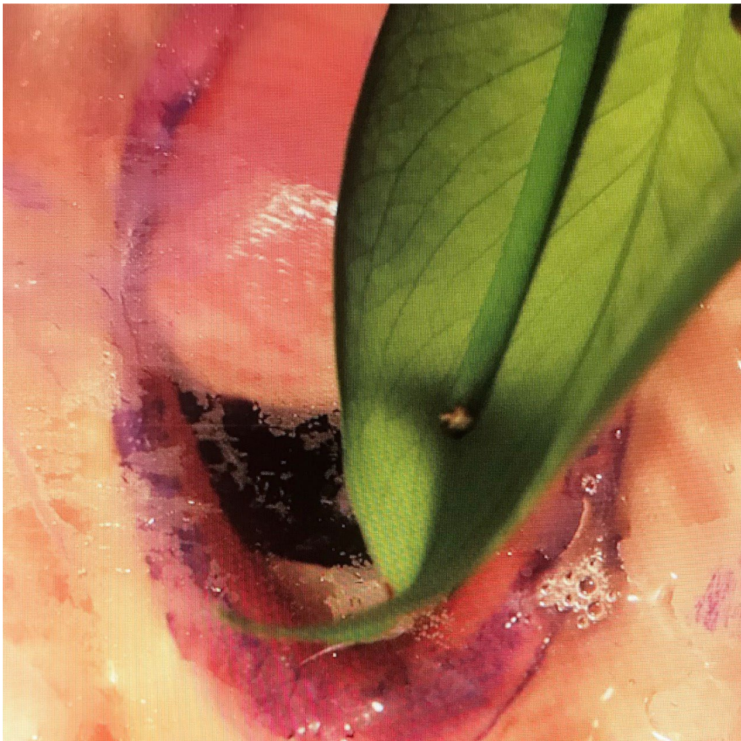
Picture 4. Detail from thesis video PLANT PLAY 2023

So, without a doubt there could be signs of ignorance, objectification, lack of information in my artwork. But at the same time, I know in my heart that my intentions originated from a place of curiosity and love for the plants. and I accept the fact that it might not have translated perfectly. As a flawed human, everything we create has stain of dirt on it. I accept and celebrate that aspect.