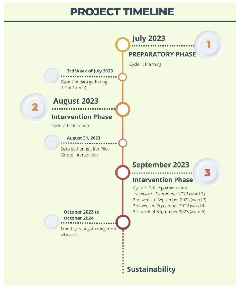
Figure 3. Project Timeline