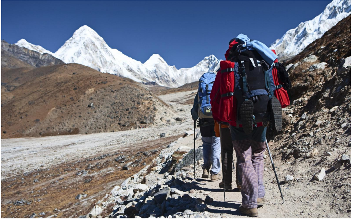
PICTURE 2. Trekking