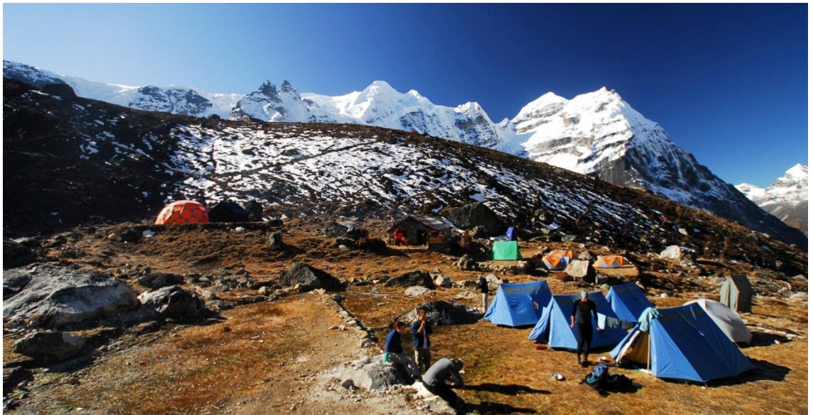
PICTURE 3. Trekking in Nepal

http://www.trekkingandtours.com/trekking-in-nepal.html