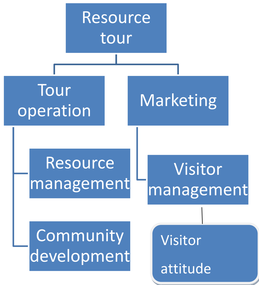
FIGURE 1. Ecotourism framework

In the view of the relationship between the two concepts, there does seem to be some merit in linking ecotourism to nature tourism, given the tremendous variety of nature related tourism interest however, there is also ambiguity in separating nature tourism from other forms of tourism, all of which rely upon the use of natural resources. Even mass, resort base tourism relies upon undeveloped resources, as a central component of the product and experience. An important aspect of high wins, discussion includes the fact that not all types of nature tourism are necessarily compactable with each other or the environment. The importance of management in guiding the ecotourism product was central to the work of Fennell and Eagles (1990), who included the resource tour as the principal component of the ecotourism experience; the service industry including tour operation, government policy, resource management and community development; and visitors' experiences, based on marketing, visitor management and visitor attitude.