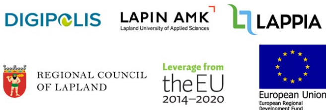
Figure 2. The logos of the project partners and funding.

The collaboration between Finnish Universities of Applied Sciences started in the “CircularEconomyUAS” project (2020), which was a national development project of circular