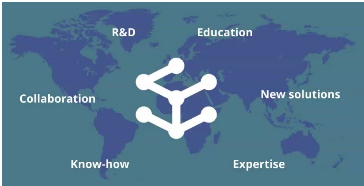
Figure 3. The objectives of the UArctic TNCE presentation (Tyni, 2021b).