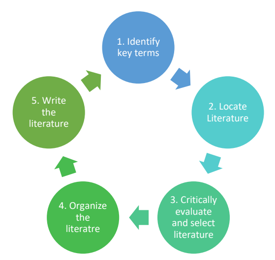
Figure 1. Adapted from University of Bahamas, 2020 (Virginia Balance)