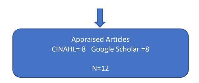
Figure 3 Selection Process