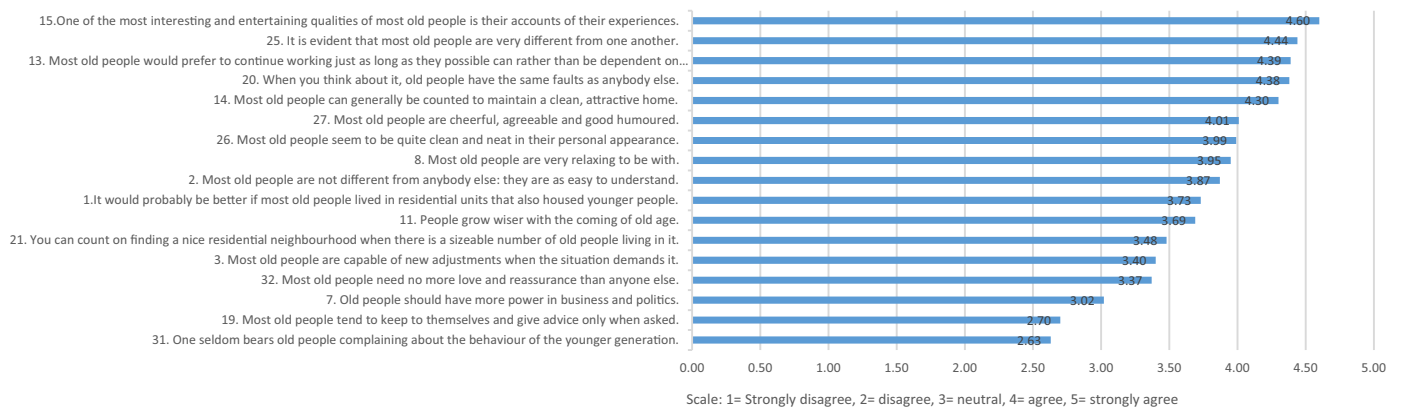
Fig. 1. Nurse students' (n = 523) scores of positive statements.