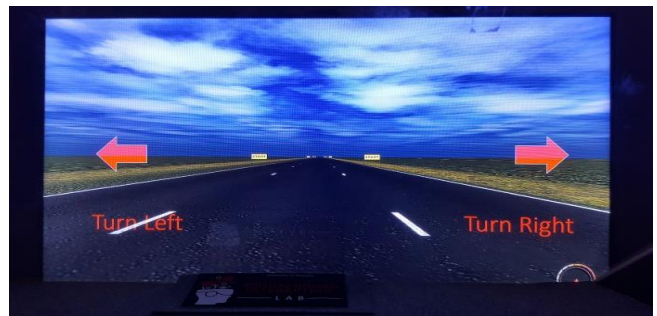
Fig. 3. The driving setup (top) and LCT simulator with overlaid turn instructions (bottom).

from the pre-recorded LCT video session to the LCT simulator software. The driver was instructed to press the accelerator pedal so that the vehicle was moving once the user took control over the driving.