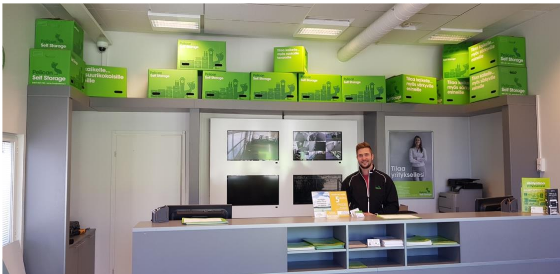
Figure 2: Pelican Kilo's customer service point and outlet

Pelican is a multinationally active business chain operating in self storage sector originally founded in 2009 by Nordic Real Estate Partners (NREP) which is now in its expansional journey reaching 9 by 2017 in Copenhagen and North Zealand. The number still keeps on being counted, with astonishing 15 in Finland and 11 in Sweden until last year. Pelican Finland Holding Oy was first in Finland established in 2010. It was Pelican Vallila funded by American Pension Fund and Nordic Real Estate Ltd. The facility located in Kilo, where the interview was arranged, was the first in Espoo, established in 2012. (Pelican Self Storage, 2018)