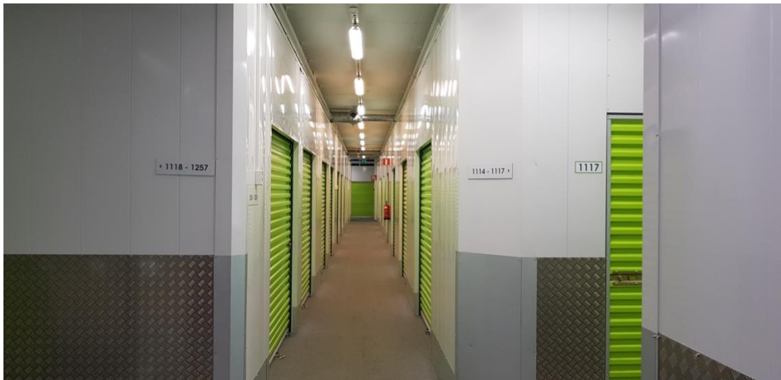
Figure 3: Pelican's storage units

Pelican has been in this business for quite a long now. Finnish Self-Storages' leaders include Pelican too. The competition is however a bit too strong in Finland with few but equally powerful companies' existence. To remain competitive, Pelican has strategically acted on the market. The drivers for such invincible professionalism include location as a one. Good location serves as a tool for increasing visibility and at the same time accessibility too. The availability of space determines whether drive-up units can be offered or not. Drive-up units are easily accessible with a vehicle allowing wide open doors, wide enough to let pass a small Truck. (Interview-Pelican, 2018)