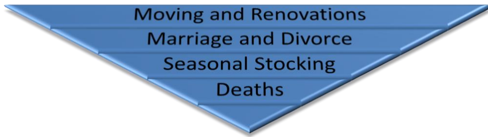
Figure 4: Reasons for choosing a Self-storage

The moving and renovations are in the top of the list as both the individuals and businesses face renovations of the building and individuals move from place to place for several reasons. Marriage and divorces occur continuously and there are situations that seek storage options at times quite often. Seasonal stuffs are in the third place. Customers live differently in different seasons of the year. All those stuffs piling up at home gets unbearably messed up igniting the thoughts of renting a space at a self-storage. Last but not the least, deaths too contribute in increasing the number of customers for self-storages.