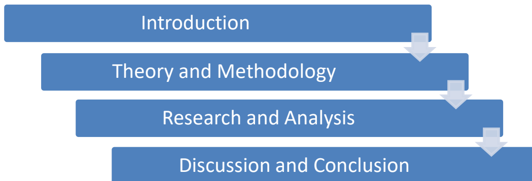
Figure 1: Structure of Thesis

explained and finally, the results are stated and analyzed which is discussed as per the research aim and the findings will be concluded with the scope for future possibilities.