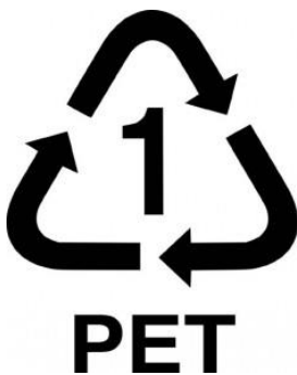
Figure 6 SPI Symbol for Plastics (AAC, 2017)

In 1980s The Society of the Plastics Industry (SPI) in USA developed so called SPI symbol. The design is based on Möbius loop; however, the arrows are thinner and plainer. This symbol is designed for plastic materials and the aim is to differentiate polymer compounds and their recycling bins based on the number in the middle (Miller, 2013). The most common SPI symbol can be found on plastic bottles representing the PET sign. The sign indicated that the bottle is manufactured from PET material and therefore has to be placed in suitable container in order to be recycled. Other synthetic polymer types on the sign are HDPE (plastic bottles), PVC (juice bottles), LDPE (frozen food bags), PS (disposable cups) and PP (yoghurt cups).