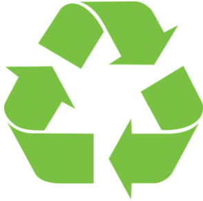
Figure 5 Möbius Loop Symbol for Recycling.

In 1980s The Society of the Plastics Industry (SPI) in USA developed so called SPI symbol. The design is based on Möbius loop; however, the arrows are thinner and plainer. This symbol is designed for plastic materials and the aim is to differentiate polymer compounds and their recycling bins based on the number in the middle (Miller, 2013). The most common SPI symbol can be found on plastic bottles representing the PET sign. The sign indicated that the bottle is manufactured from PET material and therefore has to be placed in suitable container in order to be recycled. Other synthetic polymer types on the sign are HDPE (plastic bottles), PVC (juice bottles), LDPE (frozen food bags), PS (disposable cups) and PP (yoghurt cups).