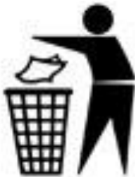
Figure 4 Tidyman Symbol (Tidy Up Britain, 2017)

Tidy man symbol is probably known all around Europe and in other countries, for example, USA. The symbol was developed by Tidy up Britain charity organization in United Kingdom which aim is to motivate people to put all litter to containers and separate them. The idea is mainly focused on general need to keep environment clean without littering since 1960s when the littering was a significant issue across the world (Tidy Up Britain, 2017). The activities of charity range from raising awareness to educating and training people. Tidy up Britain has previously launched several campaigns with celebrities to attract citizen to their legacy. The symbol is required by law to be printed on package in certain countries, for example Slovakia.