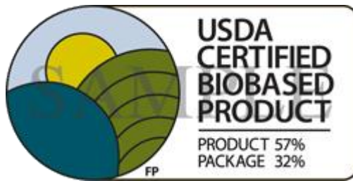
Figure 3 BioPreferred Trademark (USDA, n.d.)

Tidy man symbol is probably known all around Europe and in other countries, for example, USA. The symbol was developed by Tidy up Britain charity organization in United Kingdom which aim is to motivate people to put all litter to containers and separate them. The idea is mainly focused on general need to keep environment clean without littering since 1960s when the littering was a significant issue across the world (Tidy Up Britain, 2017). The activities of charity range from raising awareness to educating and training people. Tidy up Britain has previously launched several campaigns with celebrities to attract citizen to their legacy. The symbol is required by law to be printed on package in certain countries, for example Slovakia.