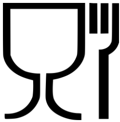
Figure 1 Food Contact Material Symbol

In 1995, the Pro Europe organisation was founded in Germany. Active until today, Pro Europe is governing recycling and responsible packaging manufacturing practises in Europe. The Green Dot trademark is their symbol that signifies the fact that the manufacturers of each package it is printed on financially contributes to national recovery organisation. There are about 170 000 companies listed as members (Pro Europe, 2017).