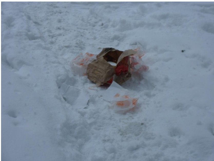
PICTURE 11. A piece of trash near the observation tower