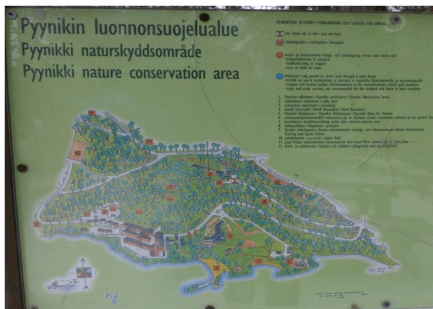
PICTURE 2. Pyynikki nature conservation area

There are several objects in the area, which are part of the built environment of Pyynikki. Facilities located in and around the protected area include observation tower with the cafeteria, summer theatre, several buildings of various kinds of use (houses for inhabitants, offices etc.), hotel Scandic Rosendahl, sports facilities (sports field, Varala International Training and Sports Center, covered exercise area, play- and sports ground near Palomäentie), and a couple of monuments (monument to Lauri Viita and monument erected on an ancient shore). Picture 2 (page 18) shows the location of these objects on the map. Two of them are worth to be described in more details as they attract tourists coming to Tampere from everywhere, hence experience the impacts of mass tourism on the environment.