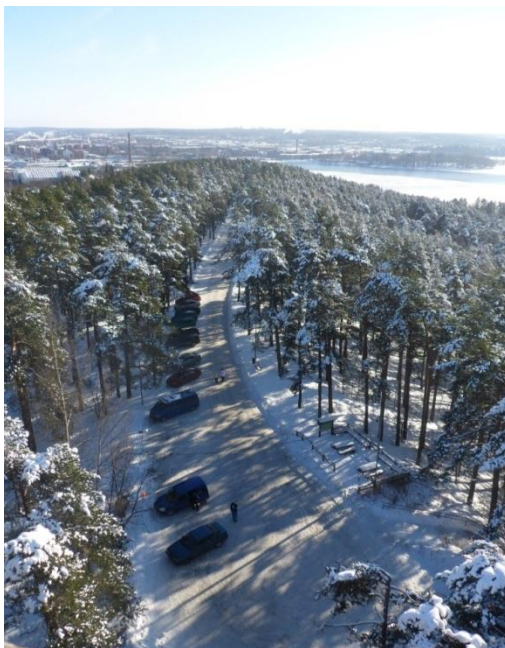
PICTURE 4. Näkötornintie in the middle of the week