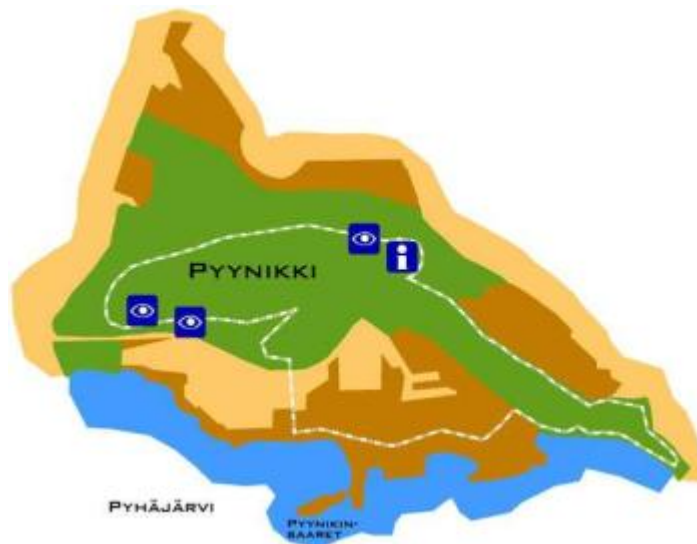
PICTURE 1. The map shows different kinds of area in Pynikki. Green colour marks protected area, brown – recreation area, and yellow – other area (Tampereen kaupunki 2012)