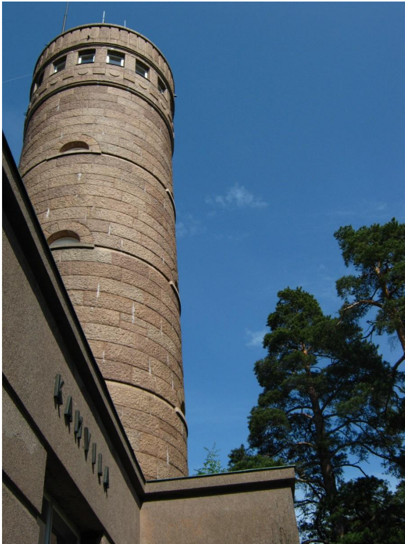
PICTURE 13. Observation tower in summer