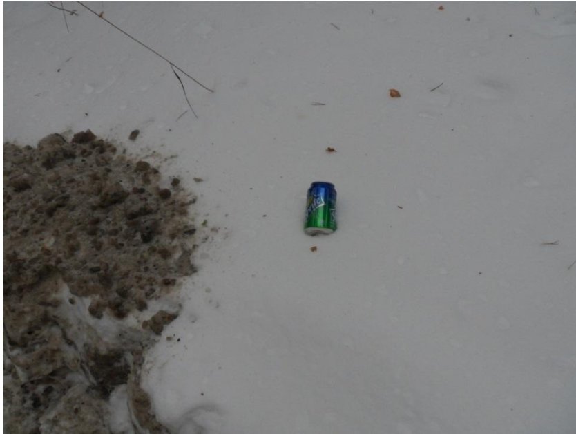
PICTURE 10. A piece of trash near Pyynikintie

Littering is not allowed in the area. There are enough trash bins in different parts of Pyynikki. For example, along the Näkötorrintie the bins are installed in every 40-50 meters. The territory is overall very clean but it is impossible to control everyone, so some leftovers of not so much responsible visitors can be found in the area (pictures 10, 11, page 31). Sometimes even close to the trash bins (picture 12, page 32), which is not the question of poor management but of the decreased responsibility level of some visitors.