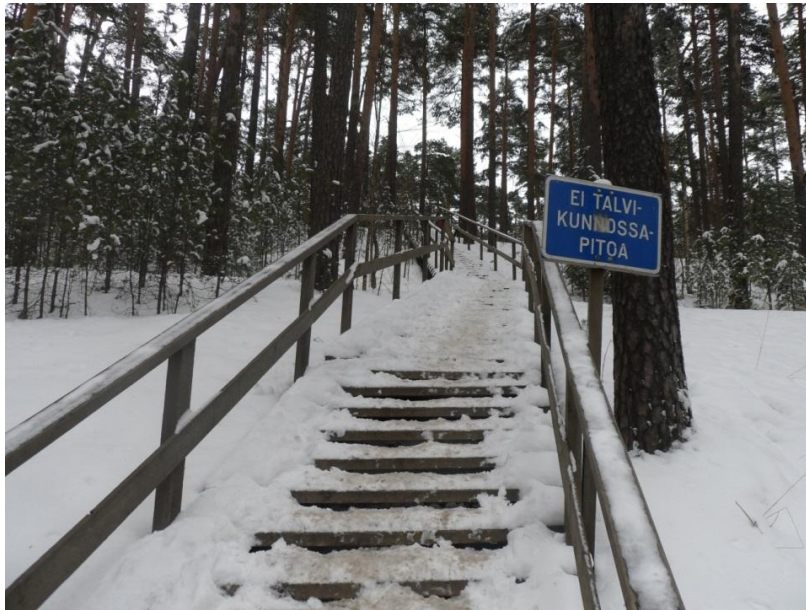
PICTURE 6. The sign telling that there is no maintenance in winter

There are built stairways on the slopes of Pyynikki ridge as well as renovated paths for the walkers. There is no maintenance of the stairs in the winter period (picture 6, page 27) but some of the paths are turned into skiing routes. There is a clear division of pedestrian and skiing routes, so that it is not allowed to walk over the ski-tracks (picture 7, page 27). It is not advised to walk along the forest paths but use the renovated paths instead, however, many people ignore this – many paths have their way through the forest in the snow.