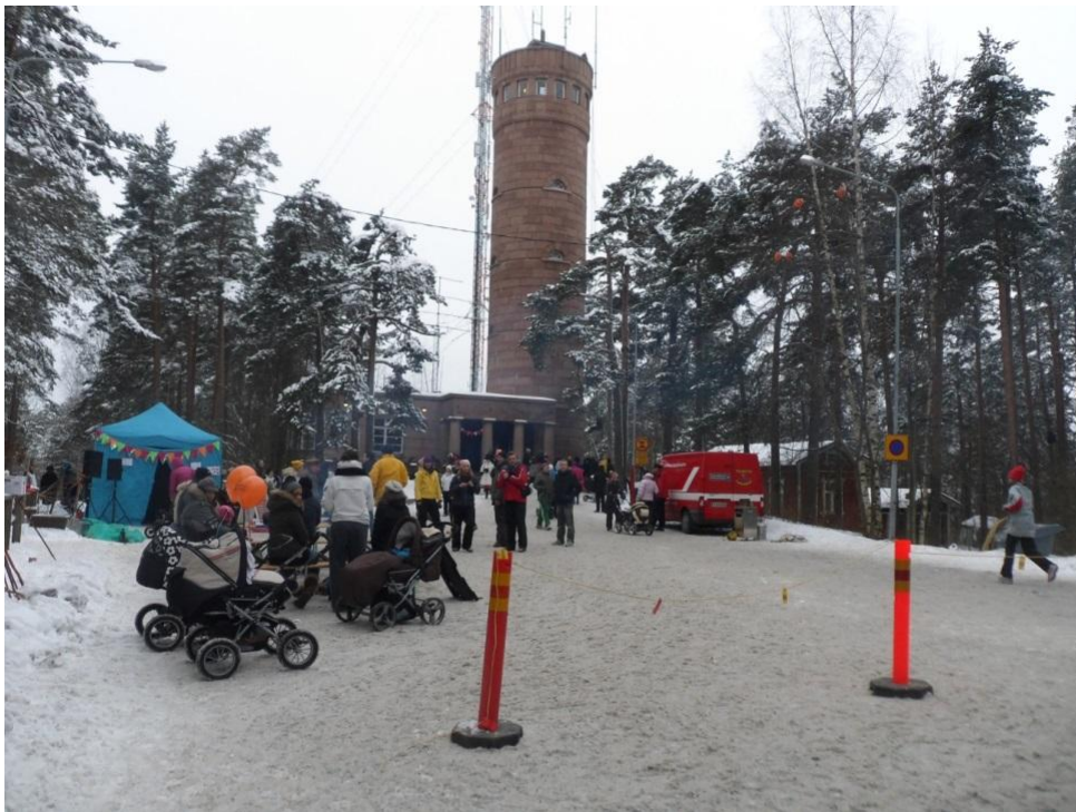
PICTURE 15. Winter Carnival on the 16 th of February 2013

The observation tower attracts locals as well as the guests of the city. According to the little chat with one of the tower cafeteria workers, there are always visitors and the workers are always busy. The tower has a lot of visitors especially during holidays and celebrations (picture 15, page 34). It was quite peaceful in the morning in the middle of the week but the worker said the sun attracts visitors both in summer and winter. The sunnier the weather is the more people want to visit the tower. When the author left the tower, all the places in the cafeteria were already taken.