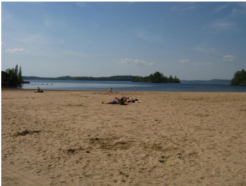
PICTURE 8. Visitors at one of the Pyynikki beaches

Pyynikki has two beaches and in summer it is possible to go swimming and taking sunbaths (picture 8, page 28). If the water is warm enough or visitors are brave enough to swim, there is a certain impact on the water quality. Although the author does not believe the scope is big enough to take it into consideration.