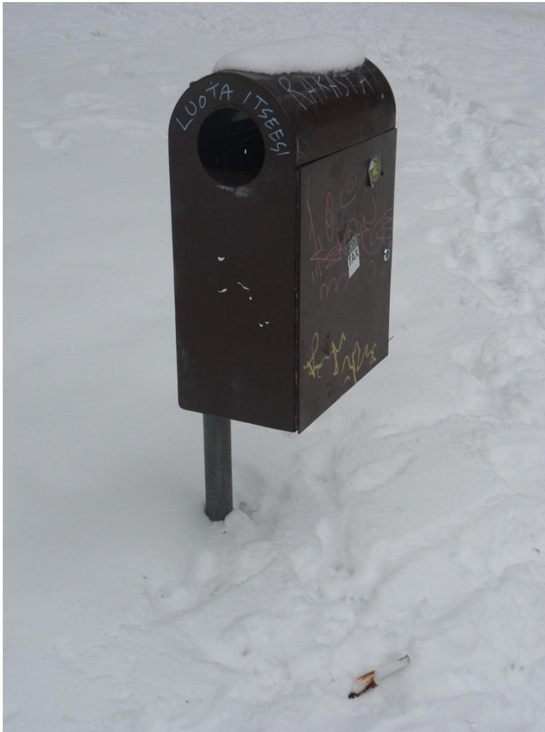
PICTURE 12. Trash bin and a piece of trash nearby