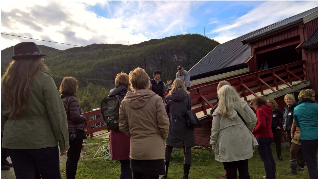
Picture 4. Fieldtrip at Lyngshestlandet

The next day we visited a local horse breeder, Lyngshestlandet. The entrepreneurs were telling us about the place and the owner told us his story and his relations to Nord-Troms and Northern Norway. At Kronebutikken we had the opportunity to taste the northernmost syrups and make our own art from fish skin guided by Reisa Skinnprodukter.