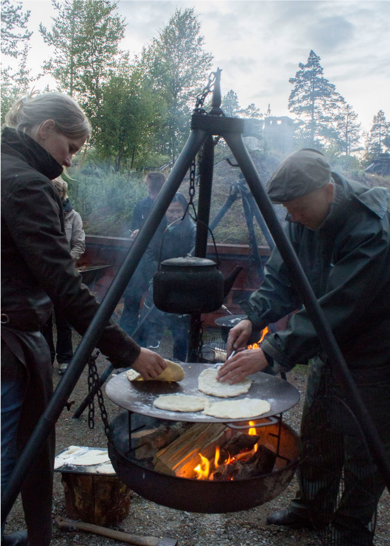
Picture 3. Food workshop at Ovi Raishiin