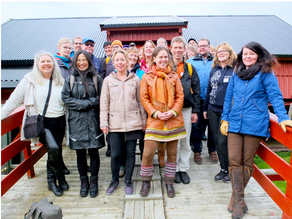
Picture 6. Group-photo