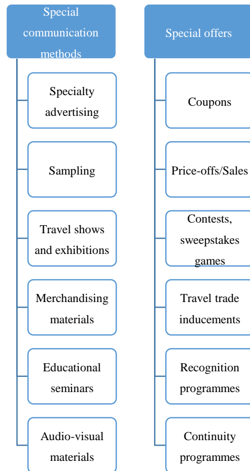
Figure 3. Sales Promotion Techniques (Morrison, 2013)

market, is also fairly essential in the context of B2B. By utilizing discounts, free gifts or merchandises, suppliers hope to persuade organizational customers towards the purchasing decisions (Ellis, 2011). In tourism industry, sales promotion techniques are divided into 2 groups (Figure 3): special offers and special communication methods (Morrison, 2013).