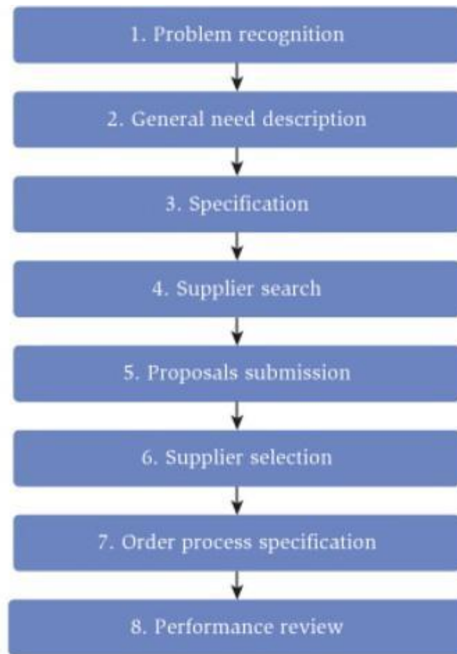
Figure 1. Organizational Buying Process (Ellis, 2011)

The 1 st stage, problem recognition, begins when a person inside the organization recognizes the need for a product or service to solve a problem. Then, in stage 2, general need description, the buying organization outlines their needs and determines the product requirements to meet those needs. At this stage, marketers can promote their products by helping the buying organization determine their needs and offer products satisfying these needs. Afterwards, the client agrees on specification, the detailed requirements of the product. In addition to answering client's questions about the selling firm's capability to meet these requirements, further advantages over competitors can be achieved by actively contributing to the specification of the product. Supplier search is conducted, in which the client actively looks for the suitable firm selling the demanded product. After choosing a set of potential suppliers,