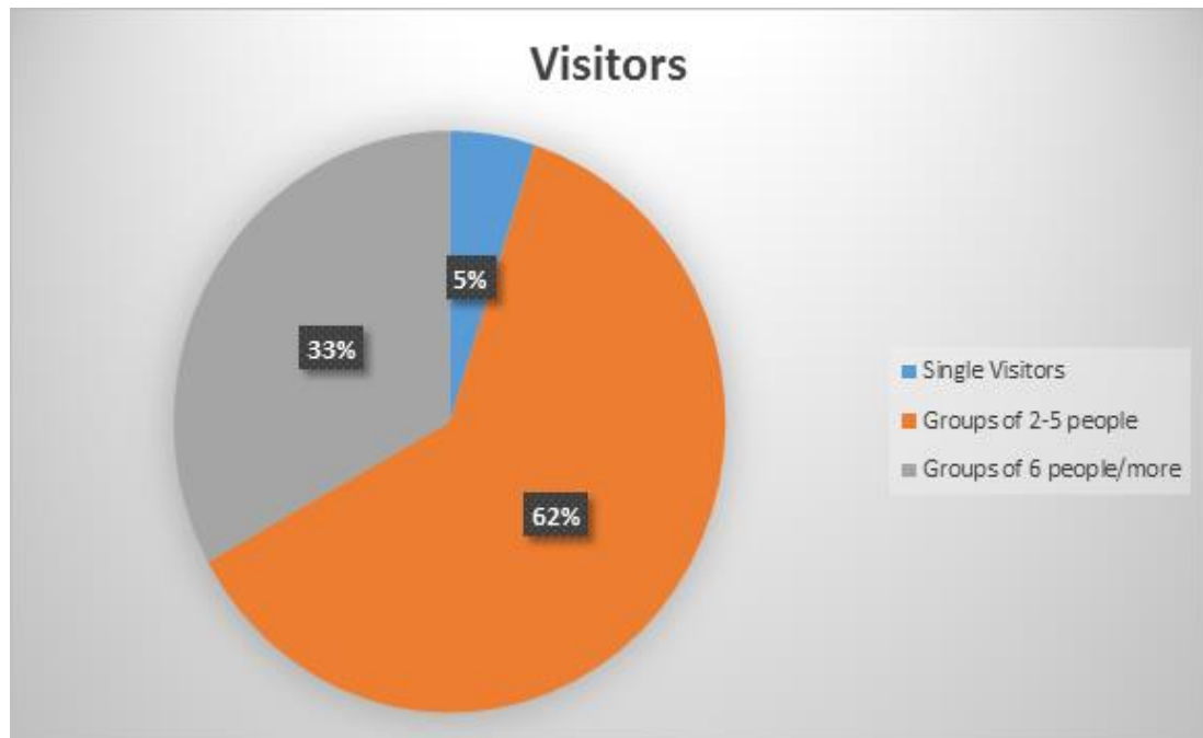
Figure 4. Visitors Coming to Repovesi National Park (Based on data provided by Selby and Petäjistö, 2009)

According to the working papers written by Selby and Petäjistö (2009), compared to two other national parks in Southern Finland, Linnansaari and Seitsemien, Repovesi national park has attracted the highest number of visitors (69,000 visitors per year). The majority of visitors to these national parks, including Repovesi, are domestic tourists, of which about 10-15% come from Helsinki area and the others mainly from the adjacent region of each park. In addition, visitors to all three national parks are divided into three main categories: single visitors, groups of 2-5 people and groups of 6 people or more. For Repovesi national park, 5% of visitors are single people, 62% are groups from 2-5 people and the final 33% are groups of 6 people or more (Figure 4). Significantly, the number of large groups of visitors (6 people or more) is higher in Repovesi compared to the other two national parks, Linnansaari and Seitsemien.