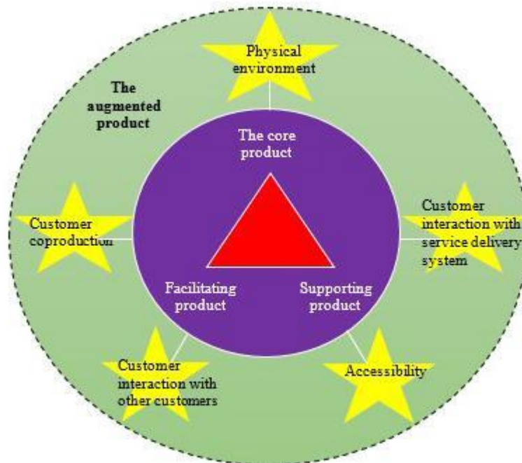
Figure 2. Product Levels

(tangible/facilitating) product, the supporting product and the augmented product (Figure 2).