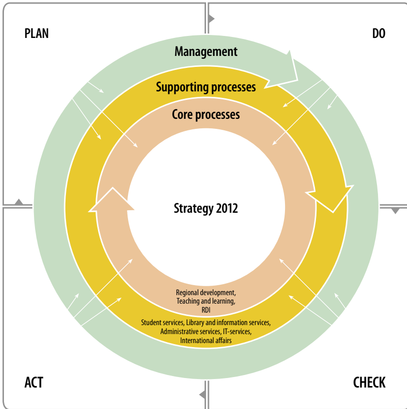
Figure 1. KTUAS Quality assurance system.

planning toward implementation. There are tools in each phase that are used to implement the phase and link it to other phases. The table on the back cover of this guide shows specific examples of how you as a student participate in the quality work of our University.