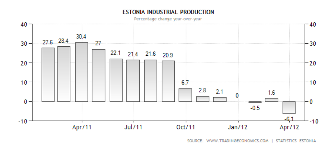
Figure 8. Estonian industrial production change 1/2011 - 6/2012 (percetages)

Despite the attractiveness of euro as a currency, Estonia is again facing a downstream in economy and this affects industrial market heavily. Industrial production in Estonia decreased 6.1 percentages in March 2012. In autumn 2011 economy started to slow down because of financial crisis. Industrial companies in Estonia are rather small and medium-sized and situation in Europe and World affects these companies negatively as their customers are more cautious of the situation.