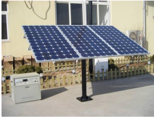
Table 5 Solar Energy system (Electricity forum)

Small scale wind energy systems – Small wind energy systems can be used in connection with an electricity transmission and distribution system these tend to have high capital costs but low running costs. Supply is intermittent and so energy storage is necessary for reliability. Wind is derived from solar energy. When the sun heats the earth's surface unevenly, it creates differences in air temperature and atmospheric pressure, which causes wind. Wind turbines for domestic or rural applications range in size from a few watts to thousands of watts and can be applied economically for a variety of power demands.