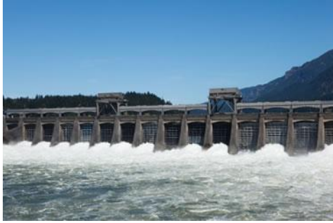
Table 4 Hydro Power system (Electricity forum 2011)

Solar energy systems: solar electricity is renewable energy that is converted from the sun and it has few environmental impacts, but initial costs can be high. Maintenance and replacement may be difficult in isolated communities. Solar Energy is better for the environment than traditional forms of energy. Countries like Nigeria with an abundance of sunlight and a population currently without electricity, represents the fastest growing potential market for solar energy, with the largest domestic market being the utilities sector.