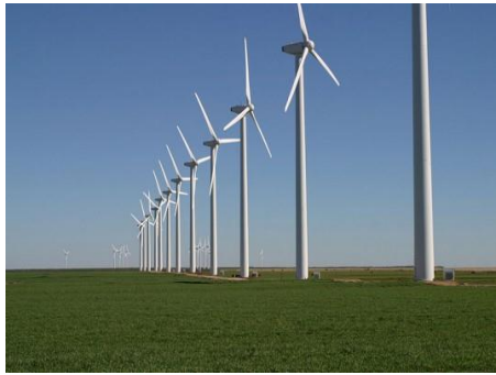
Table 6 Wind energy system (Electricity forum 2011)