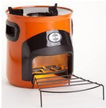
Table 7 Biomass Stove (Electricity forum 2011)