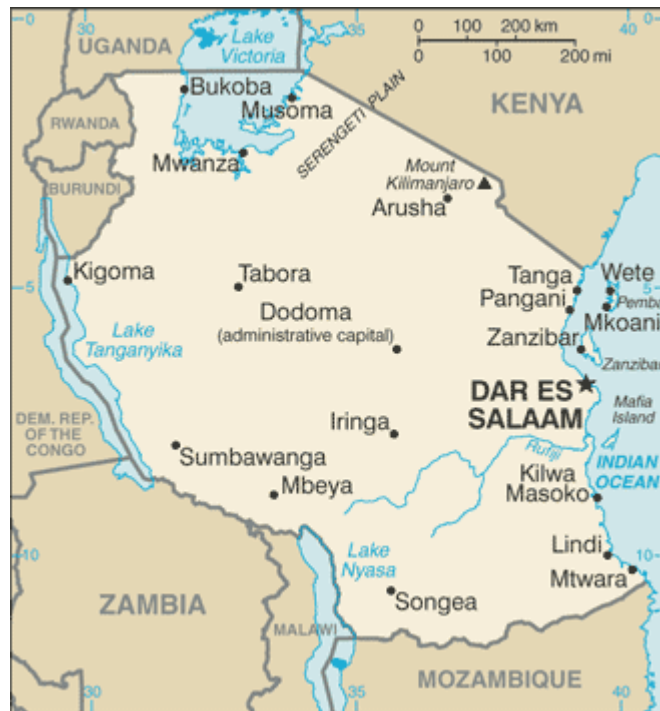
Figure 2 – Map of Tanzania

The landmarks include; The Kilimanjaro – which is the highest mountain in Africa standing at 5895 meters above sea level, Lake Victoria – the world’s second largest freshwater lake and Lake Tanganyika – the world’s second deepest lake. To top it up Tanzania also boasts a variety of wildlife with over fifteen national parks and game reserves around the country. In addition to all this, the country has abundant supplies of natural resources which include gold, diamonds, coal, natural gas and a wide variety of gemstones.