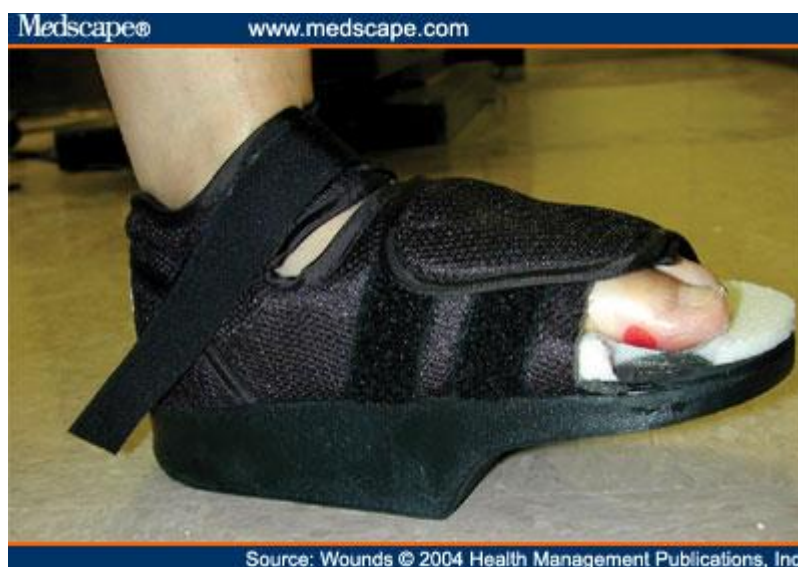
Figure 4 : Offloading footwear (Health management publication, Inc 2004).

The picture below in Figure 4 shows what an offloading footwear looks like. It helps to relieve the foot from intense pressure that may cause ulceration.