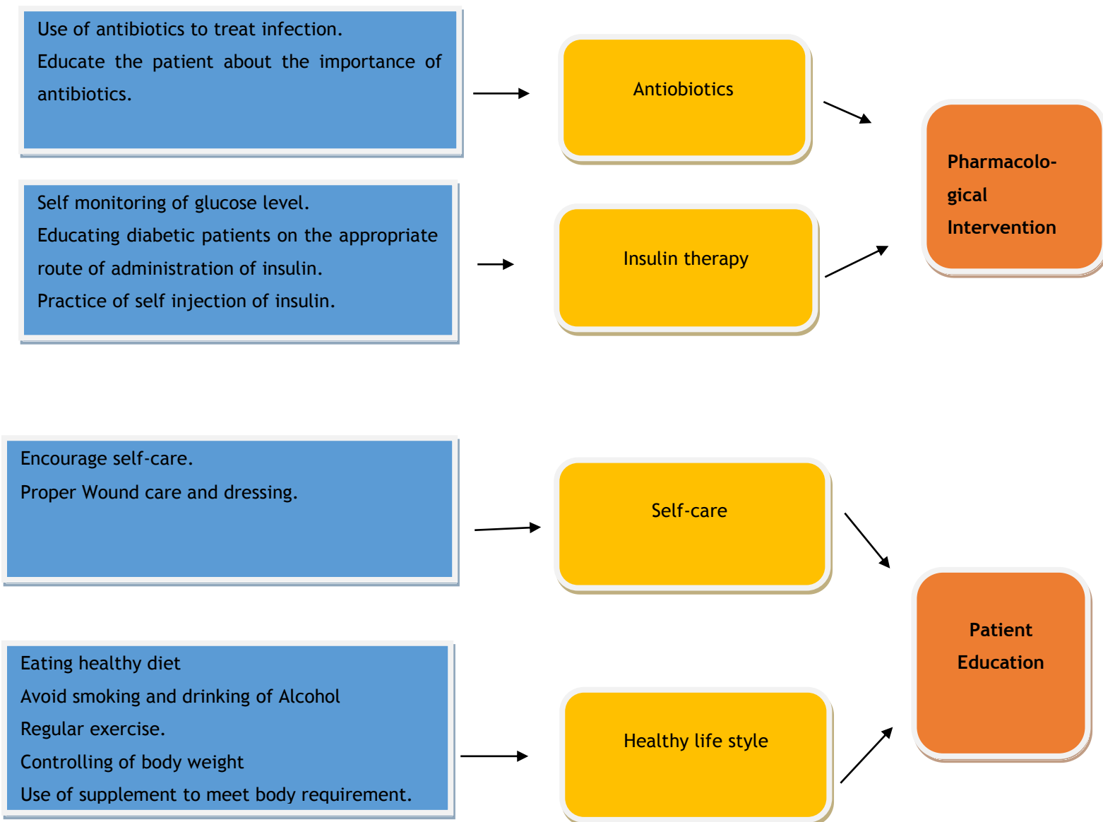
Figure 3 : Illustration of the inductive content analysis process.