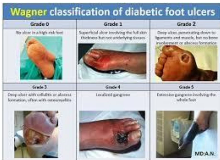
Figure 1 : The Wagner classification of diabetic foot ulcers . (Kumar Amir C Jain, 2012).

As shown in Figure 1 below, Kumar Amir C J. illustrates the Wagner classification of diabetic foot ulcers.