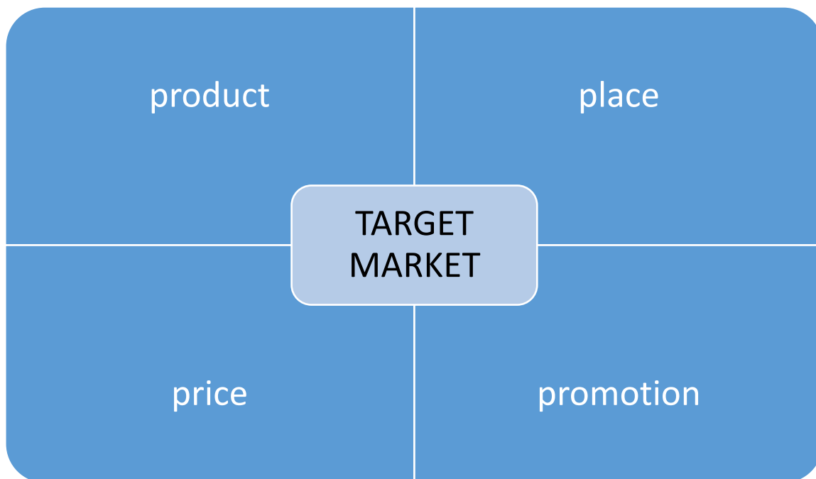
Figure 3. Marketing Mix

Sales Promotions are done to inform customers about the new product, to increase sales, create a positive image, etc. It is all marketing activities other than personal selling, advertisement, and public relations. (Kotler, 2010.)