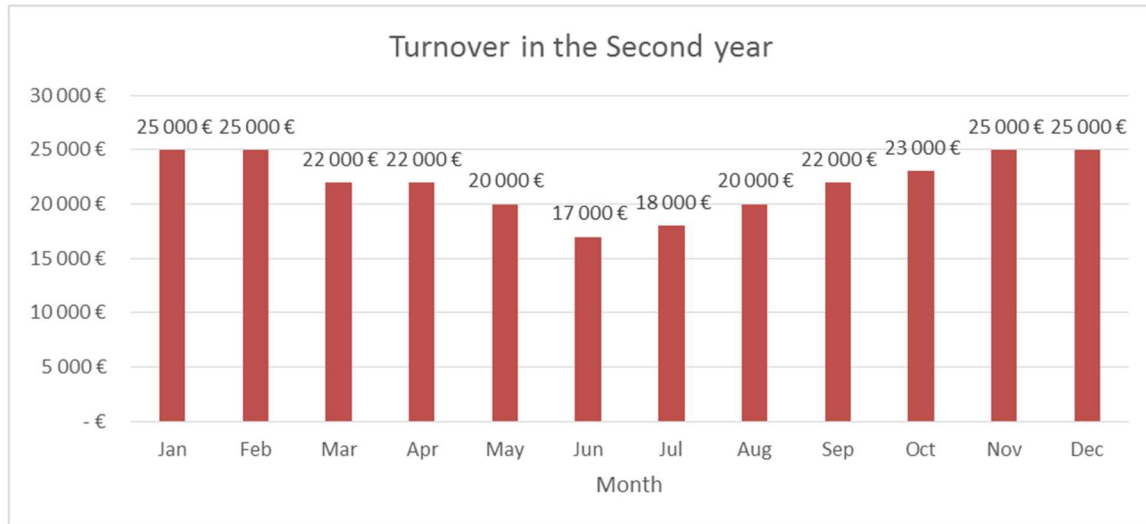
FIGURE 3. New restaurant turnover in the second year

In the second year, as can be seen in Figure 3, the revenue has a slight increase compared with the first year. The total revenue is 264 000 €. The minimum costs and maximum costs are the same. Finally, the balance in the second year is the profit maximum 62 400 € or minimum 3 600 €.