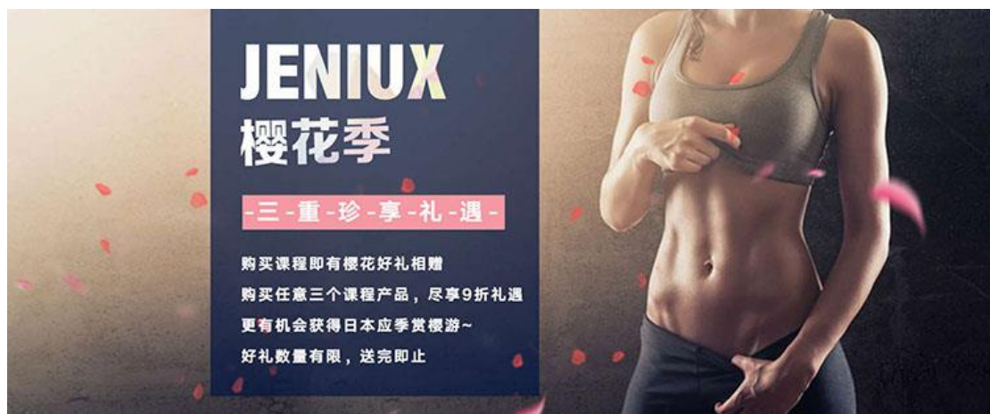
FIGURE 1. Jeniux [2]

Zhen Meng fitness management Ltd in Shanghai offers professional rehabilitation courses about different yoga programs. The company is a small-sized entrepreneurship, located in the new district of Pudong, Shanghai. It is one of the companies that emphasize on fitness management during the past several years. [1]