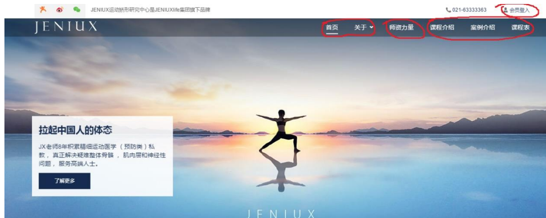
FIGURE 4. Official Website of Zhen Meng [12]

The first and second windows provide access to the general information of the company. They introduce what Zhen Meng is, what it specializes in and they provide contact information including email address, location in the map, phone number and public channel in social media.