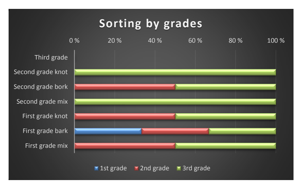
Figure 15. Excel table of sorting by grades

However, it should be kept in mind that the boards are already sawed to the right size; therefore the length of the board should be taken into consideration in the marking process. So it is not reasonable to use three-meter boards for an order of a one-meter board, if we take into account sustainable development around the world and the use of raw materials.