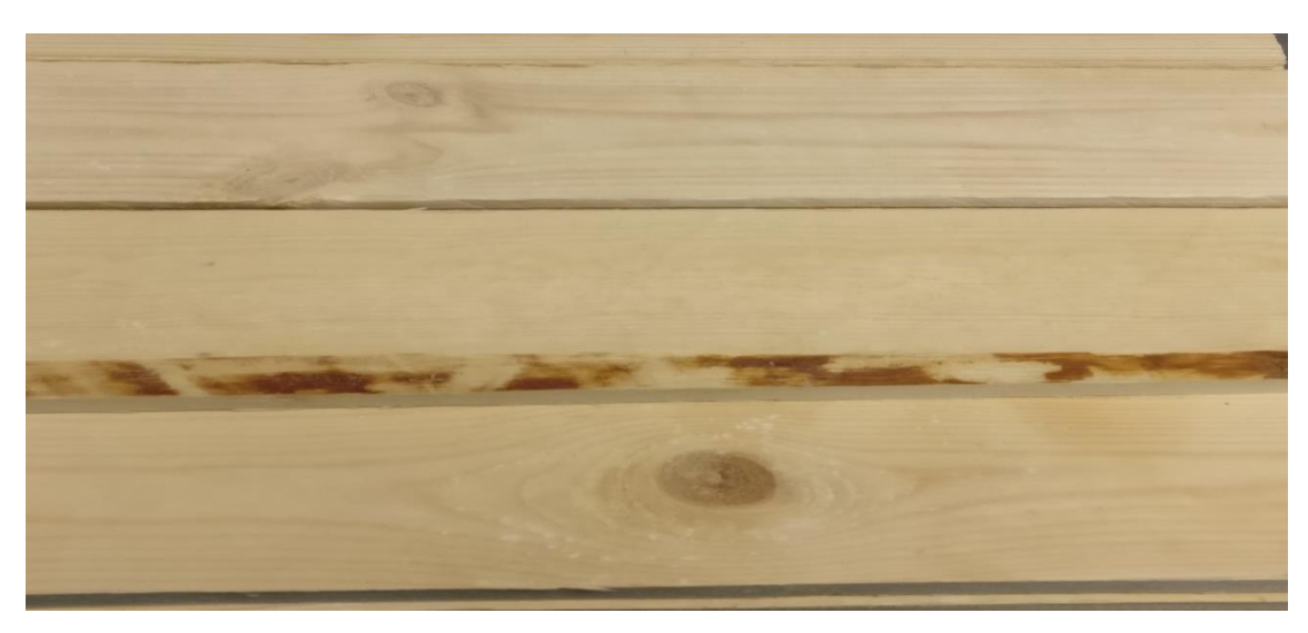
Figure 19. 3<sup>rd</sup> grade

There is no division of the number of knots and bark. Moreover, there is mainly a progressive production. There is a division due to the length of the deferred raw materials.