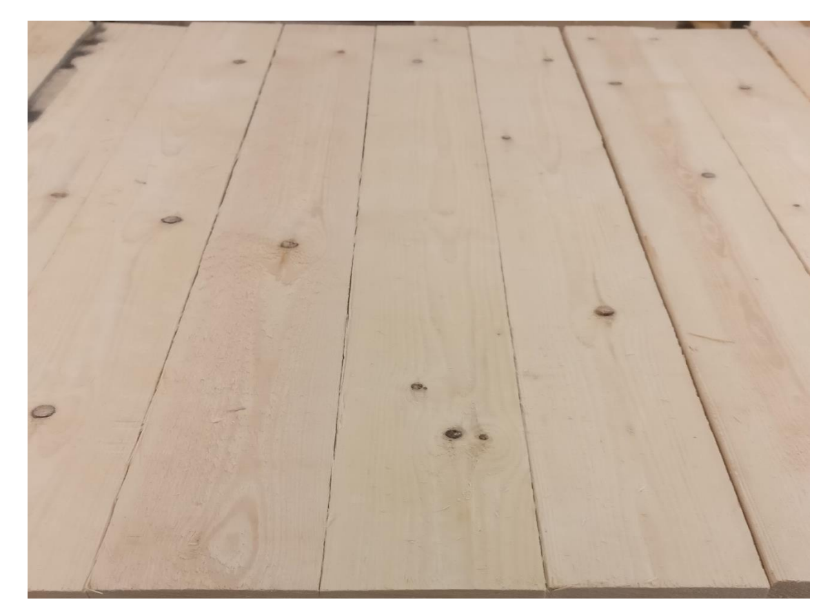
Figure 13. Knots

For the first grade, but with a lot of knots - a basket with the board of good quality. However, for the first grade, it has a too large number of knots of a large size (Figure 13).