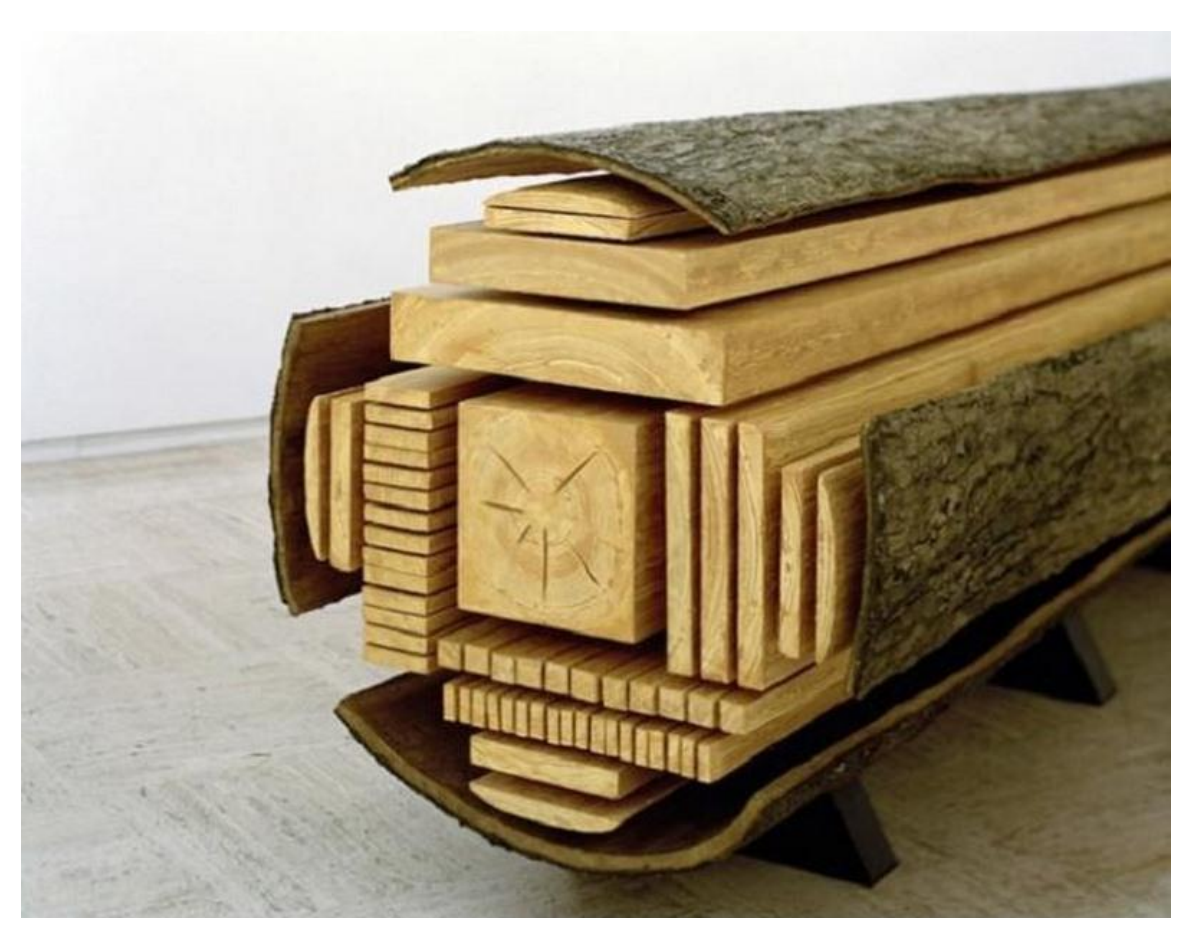
Figure 16. Wood cut

VersoWood makes deliveries of raw materials based on its production principles. It is challenging to influence this company directly, but it is possible to do it indirectly. The main probability of spoilage depends on which side of the package with wood is the sawing. Under the condition that packages of the wood with 400 pieces are 6 meters long. Wood sawing begins at the right size and here is the first opportunity for spoilage. An example of sawing a tree trunk is in Figure 16: