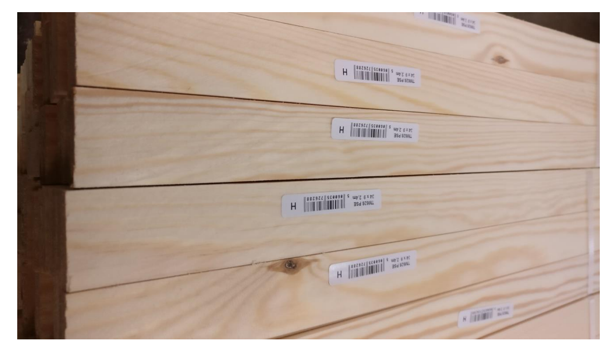
Figure 7. Type of mouldings, TM

2. Pared down, without bark, the presence of knots, the size of the knot should not exceed five millimeters, the number of knots is not limited, but the less, the better (Figure 7)