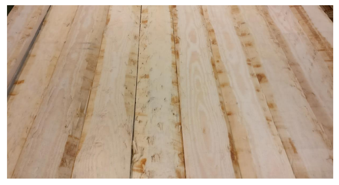
Figure 12. Bark

For the first and second grade, there are three baskets that we will use in the marking system. For the lowest grade, such three baskets are useless, given the fact that if timber is bad for this grade, then it is spoilage. For the first grade, but with a lot of barks - a basket with a good board, which is suitable for further rasping for smaller orders (Figure 12).