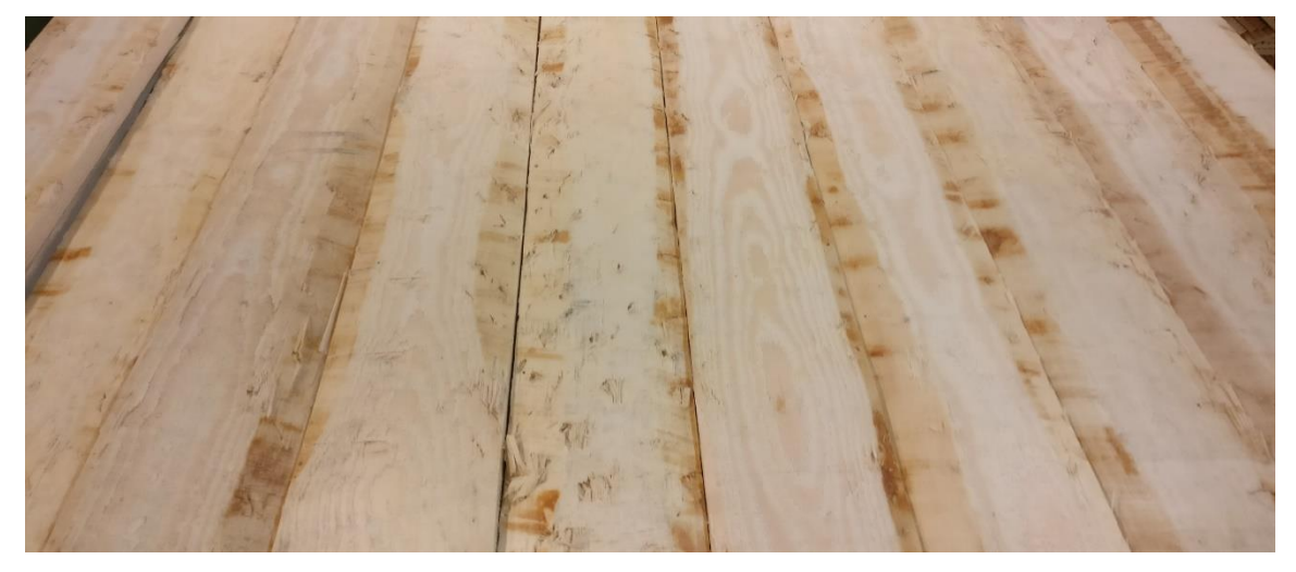
Figure 17. 1<sup>st</sup> grade