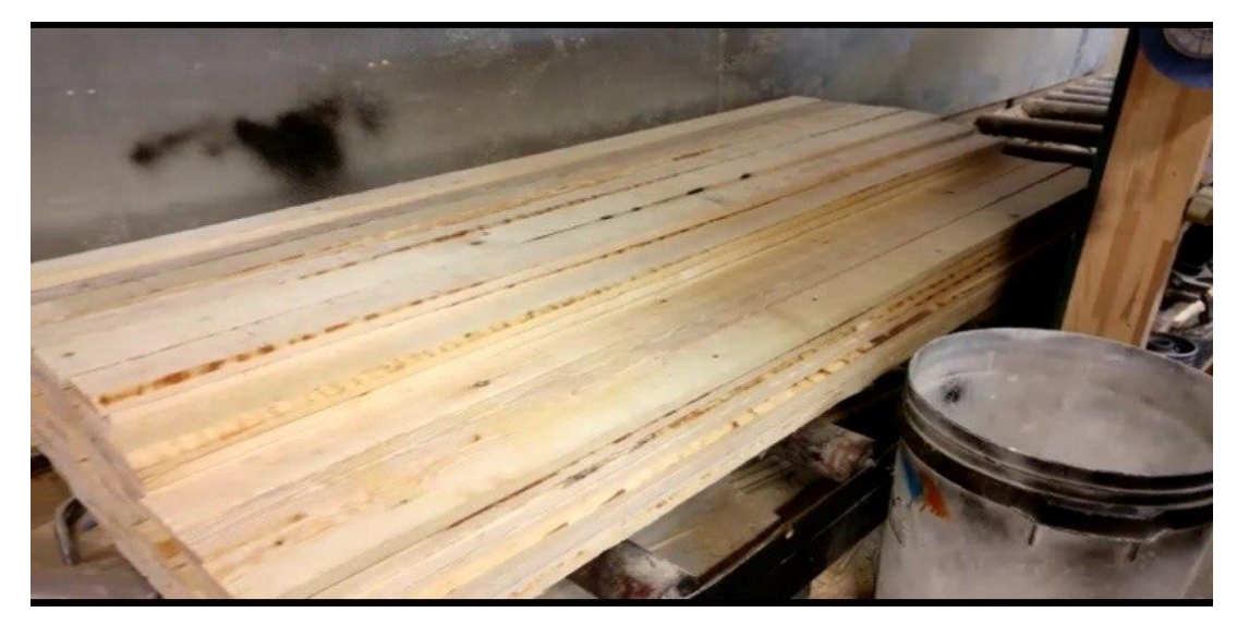
Figure 10. Low quality

So appears deferred raw material, which is not suitable for this order. It lies in a separate pile, in order not to interfere with further production (Figure 10).