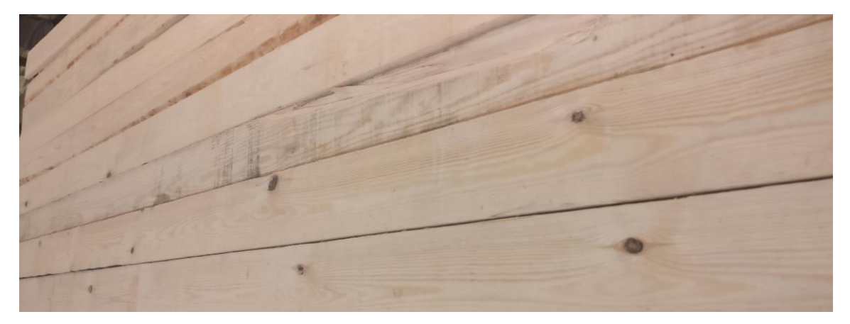
Figure 18. 2<sup>nd</sup> grade