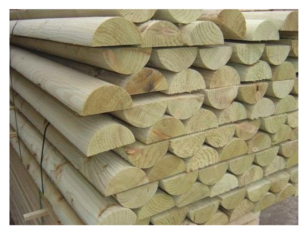
Figure 2. Type of moulding.

The given images help to understand what type of products the company makes and for what the excellent sorting system is initially necessary. Also, it is already possible to understand where and in which details spoilage can be found.