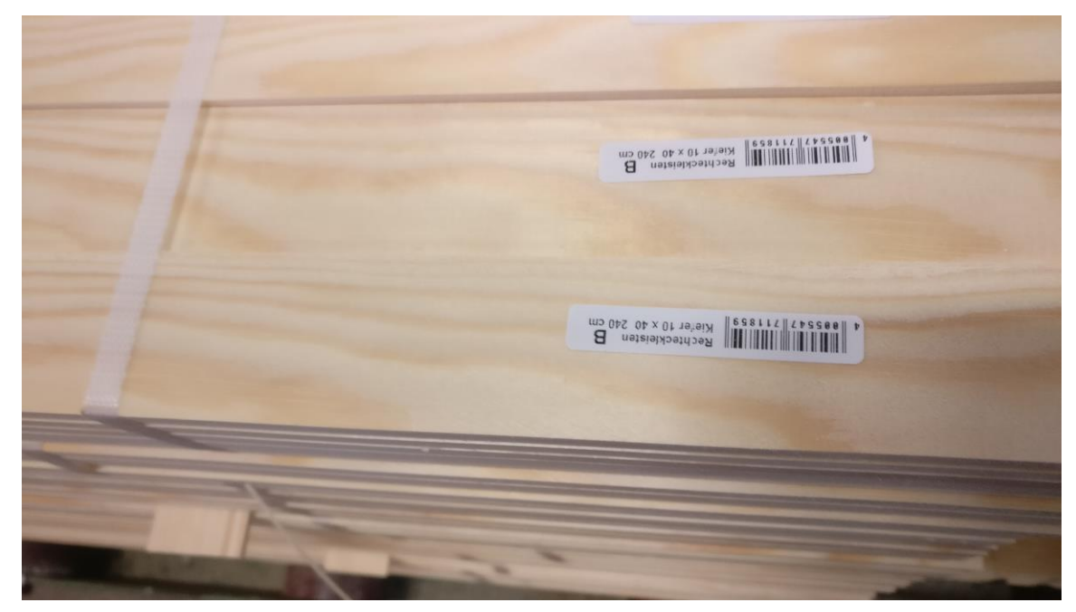
Figure 6. Type of mouldings, AMKO

2. Pared down, without bark, the presence of knots, the size of the knot should not exceed five millimeters, the number of knots is not limited, but the less, the better (Figure 7)