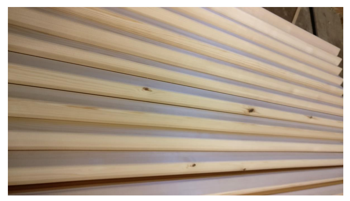
Figure 8. Type of mouldings, CM

Companies from Switzerland, Germany, as well as AMKO from Finland, order the first option. Arvolista orders the large size of the metric area and the same quality. The second option is sent to England with the mark CM. The third option is also sent to England, only marked TM.