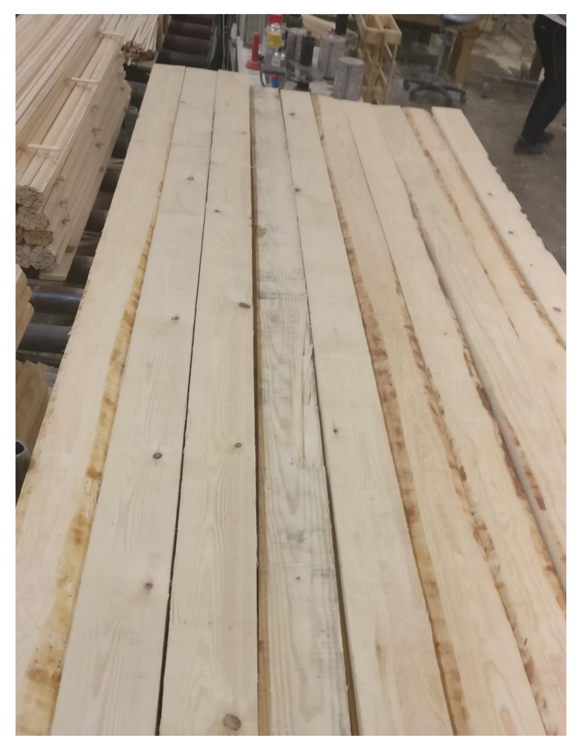
Figure 14. Mix

For the second grade, but with a lot of bark - the same approach. It is suitable for smaller orders of the second or third grade. For the second grade, but with a lot of knots, the wood is only for orders of the third grade. For the second grade, (mix), the wood is only for orders of the third grade of a small size in view of planing.