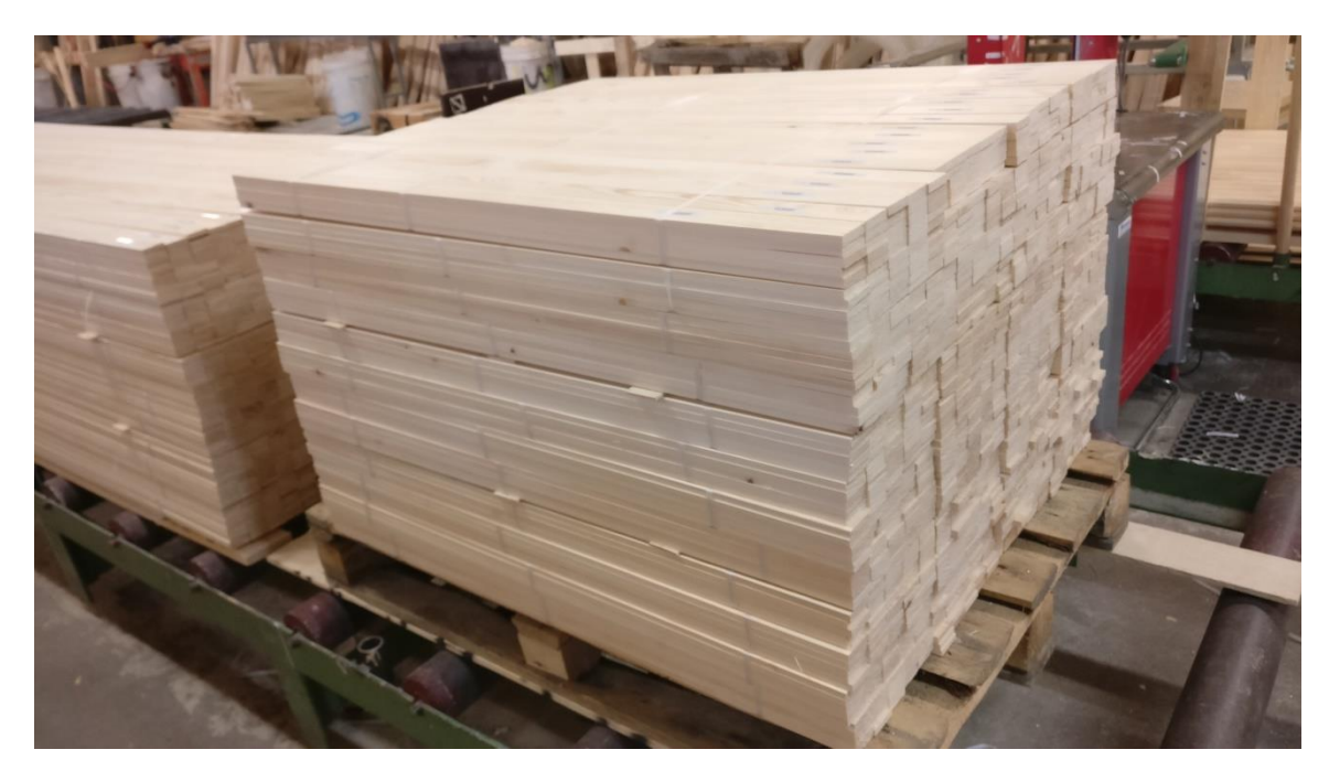
Figure 11. End product

The ready order is collected to the pallets (Figure 11). After that it is packed and sent to the customer. The cycle of work is finished.