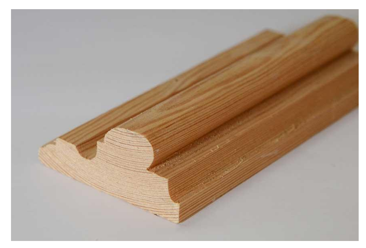
Figure 1. Type of moulding

The company produces both standardized mouldings and customized mouldings. The standards of various countries also show slight variations. To comprehend what this company is creating, we need to cite the image data as an example (Figure 1;2):