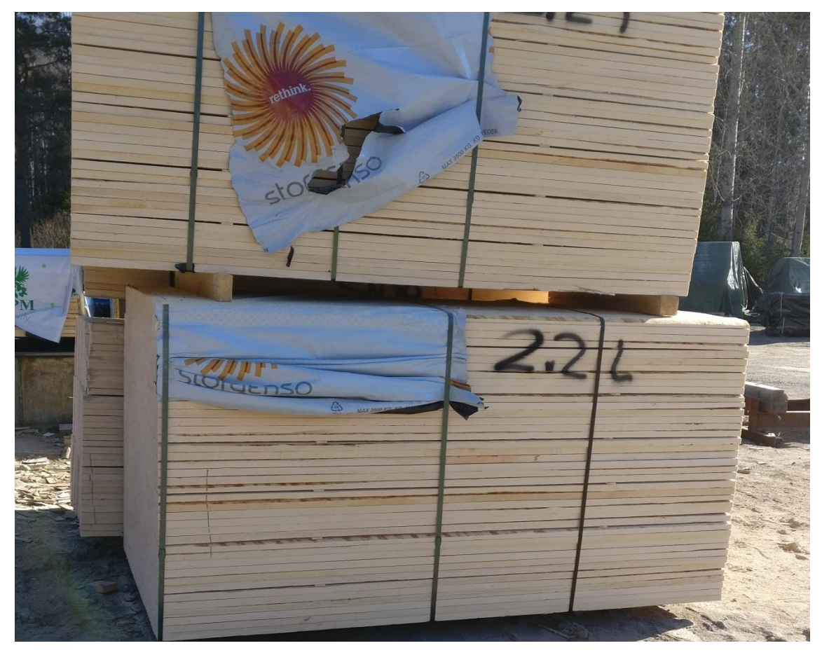
Figure 9. Raw materials

One of the companies makes an order for a certain capacity of products that they need. While the order is processed and confirmed, the company receives an order for the right amount of wood, taking into account possible spoilage, both at the receipt of raw materials (Figure 9) and during manufacture.