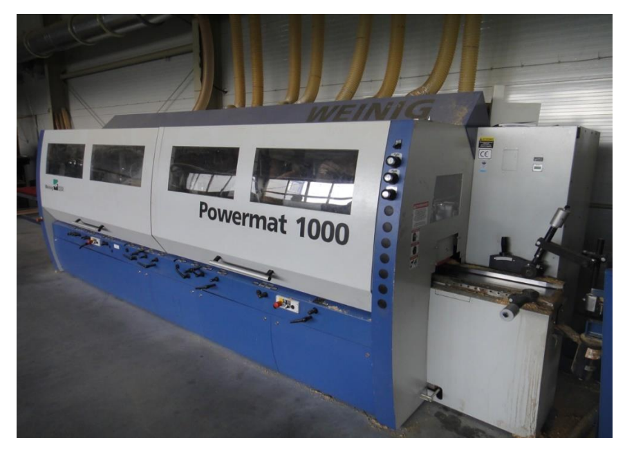
Figure 3. Powermat 1000

Different kinds of ready wood products are obtained thanks to this planing and milling machine Weinig Powermat 1000. It is a basic model of this series (Figure 3)[6]: