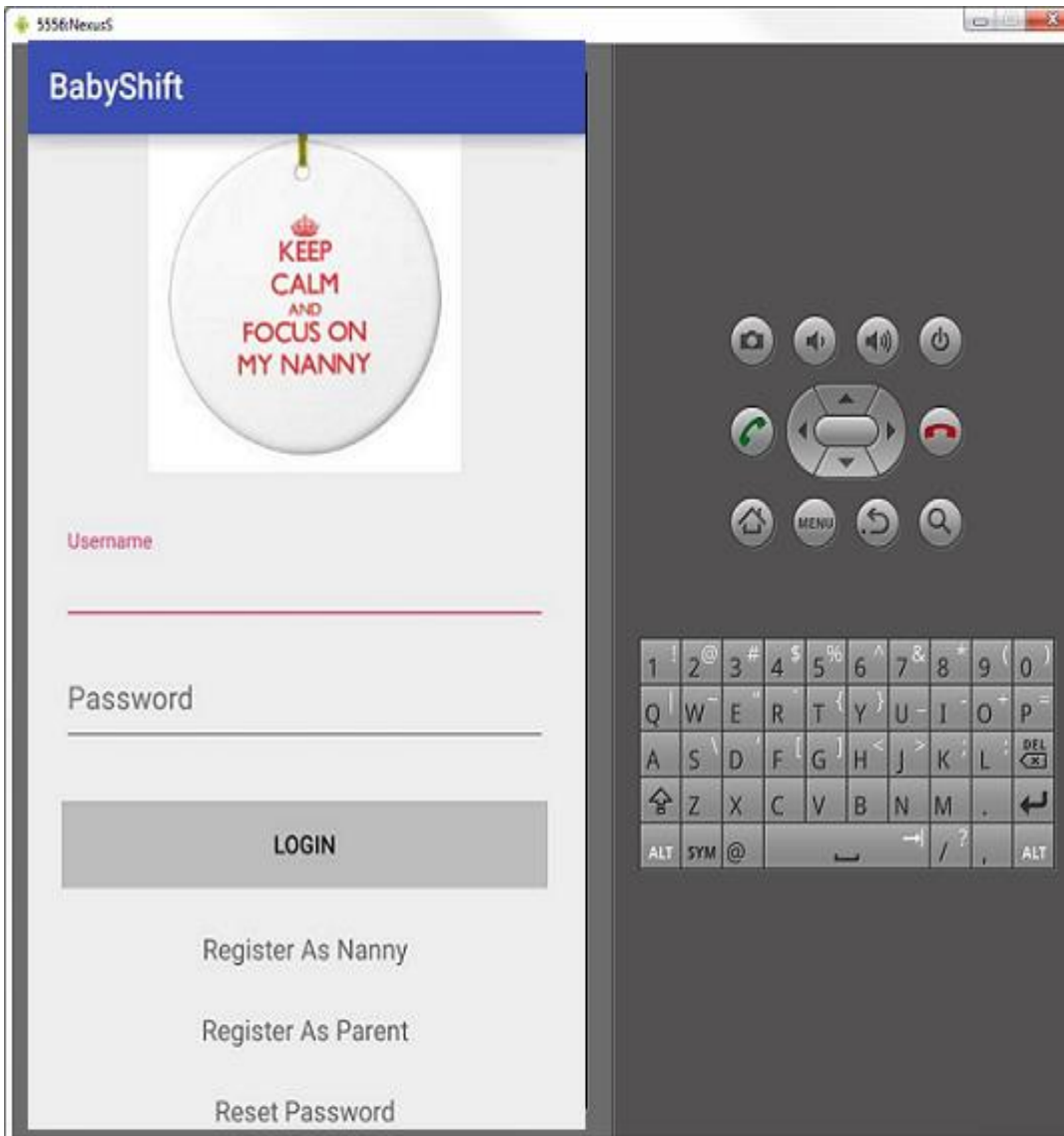
FIGURE 1. BabyShift run on the Android Emulator