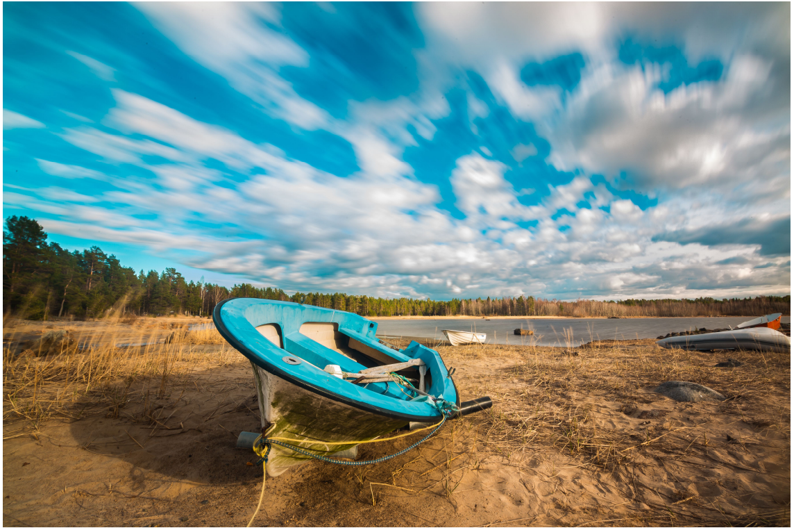
Fig: 2 Landscape Photography example: (Mukul Pradhan Photography)