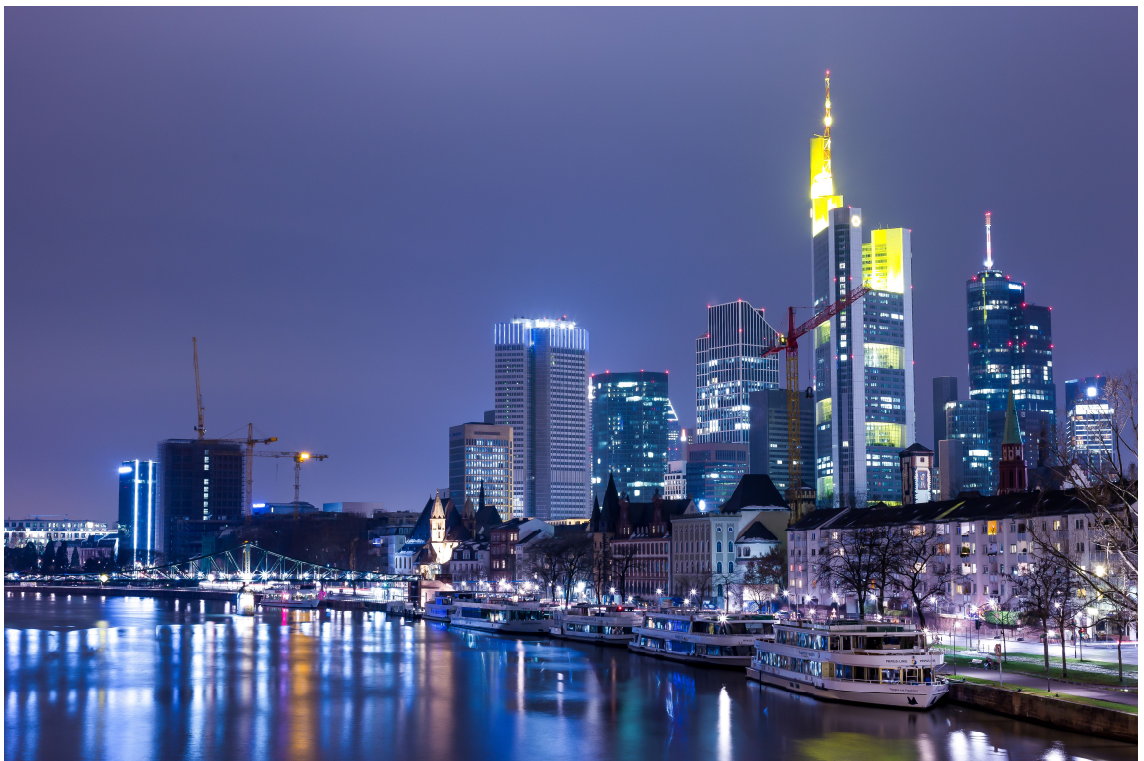
Fig: 3 Cityscape Photography example: (Mukul Pradhan Photography)