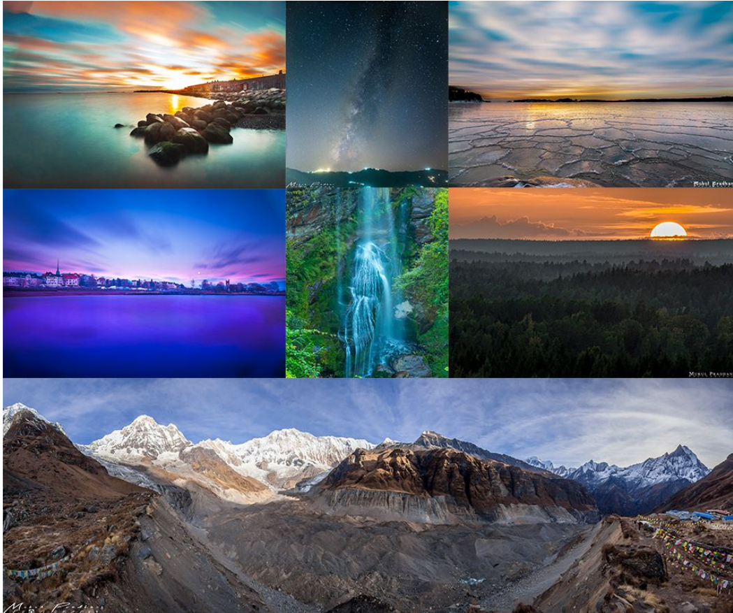
Fig: 1 Travelling Photos Collection

Visual marketing examples of Landscape and cityscape in below pictures: