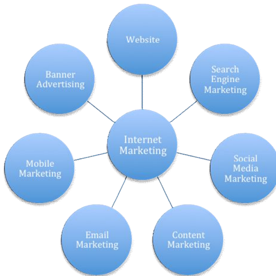
Fig: 5 Internet Marketing Plans

Internet marketing is a subgroup of digital marketing. In circumstance the most important component since the majority of digital marketing activities fall within the boundaries of Internet marketing. Below we will see how digital marketing budgets are used up and their association with Internet marketing. (Chris 2014.)