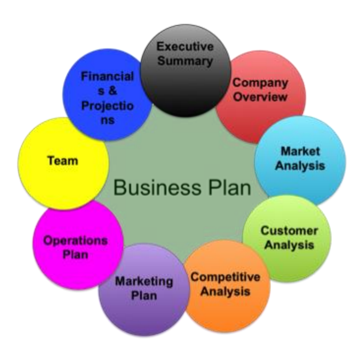
Figure 1. A possible business plan structure