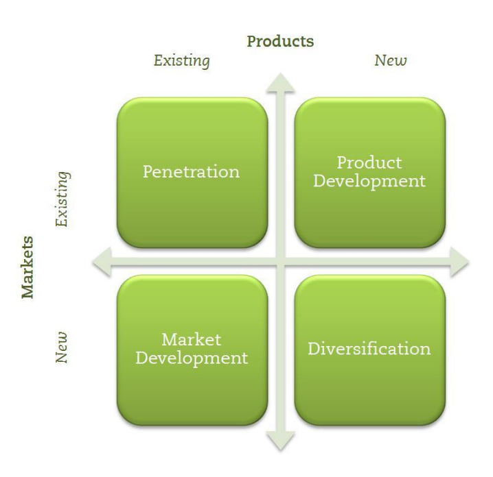
Figure 3. Ansoff Matrix (Ansoff 1957)