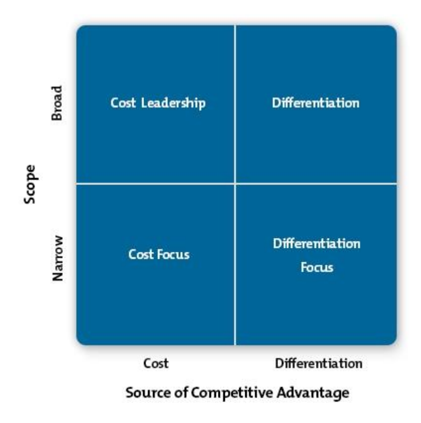
Figure 2. Source of Competitive Advantage (porter 1980)