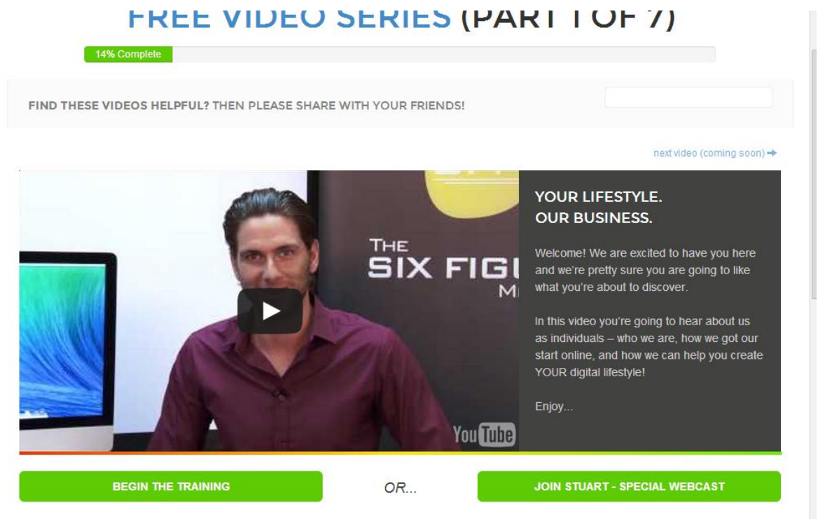
Figure 2. Video series page buttons screenshot

In the page where the videos from the free video series appear, as you can see in Figure 2, there are 2 green buttons which was very confusing for me. On one of them it is written “Begin training” but since I was already looking at training videos I didn’t know what could that be. Also the second buttons was about joining a webcast-also confusing. And the fact that both of the buttons were in the same color didn’t help at all.