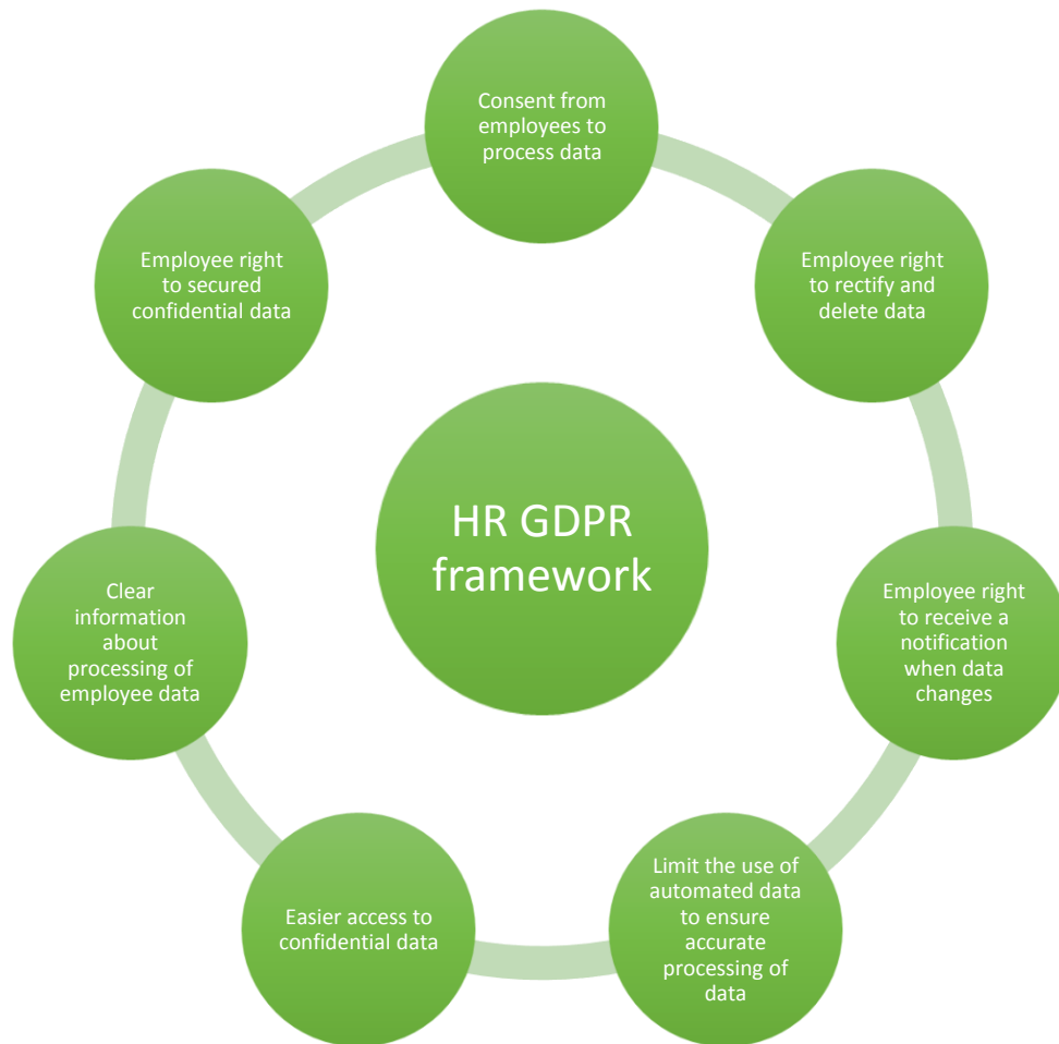
Figure 1. HR GDPR framework (Council of the European Union 2015).

The above HR GDPR framework works as a guiding tool in comparing the research question and studied theory to the findings. Every bubble surrounding the HR GDPR framework is a principle regulation that the HR needs to follow to comply with the GDPR. This framework will be used to see the status of the operating companies in relation to the framework.